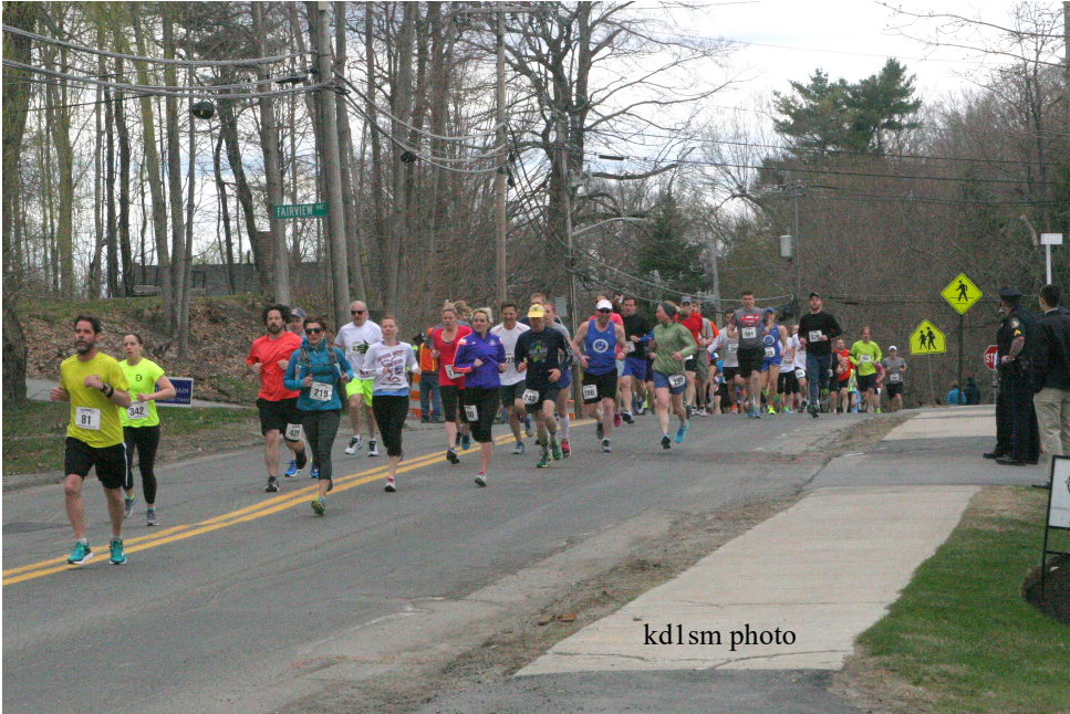
Runners pass NCS in the 2015 Groton Road Race

Other Race details may be found on the Groton Road Race Web site: http://www.grotonroadrace.com/