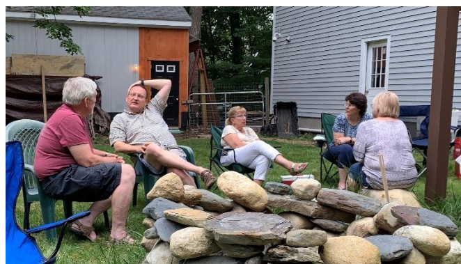
It was a great, bug-free, afternoon to just relax and gab.