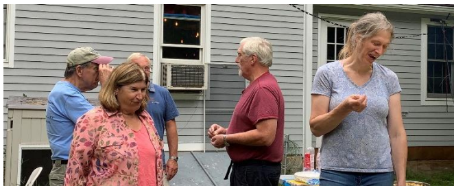
One count had it at two dozen happy campers. Discussion groups formed and re-formed.